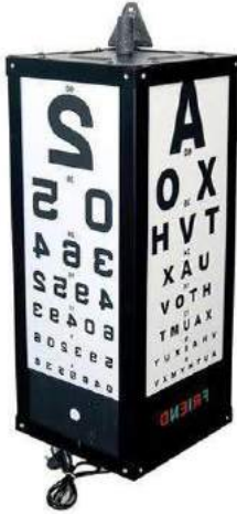
Image of Snellen Chart